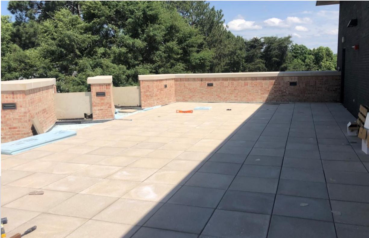
Patio Roof Paver Progress