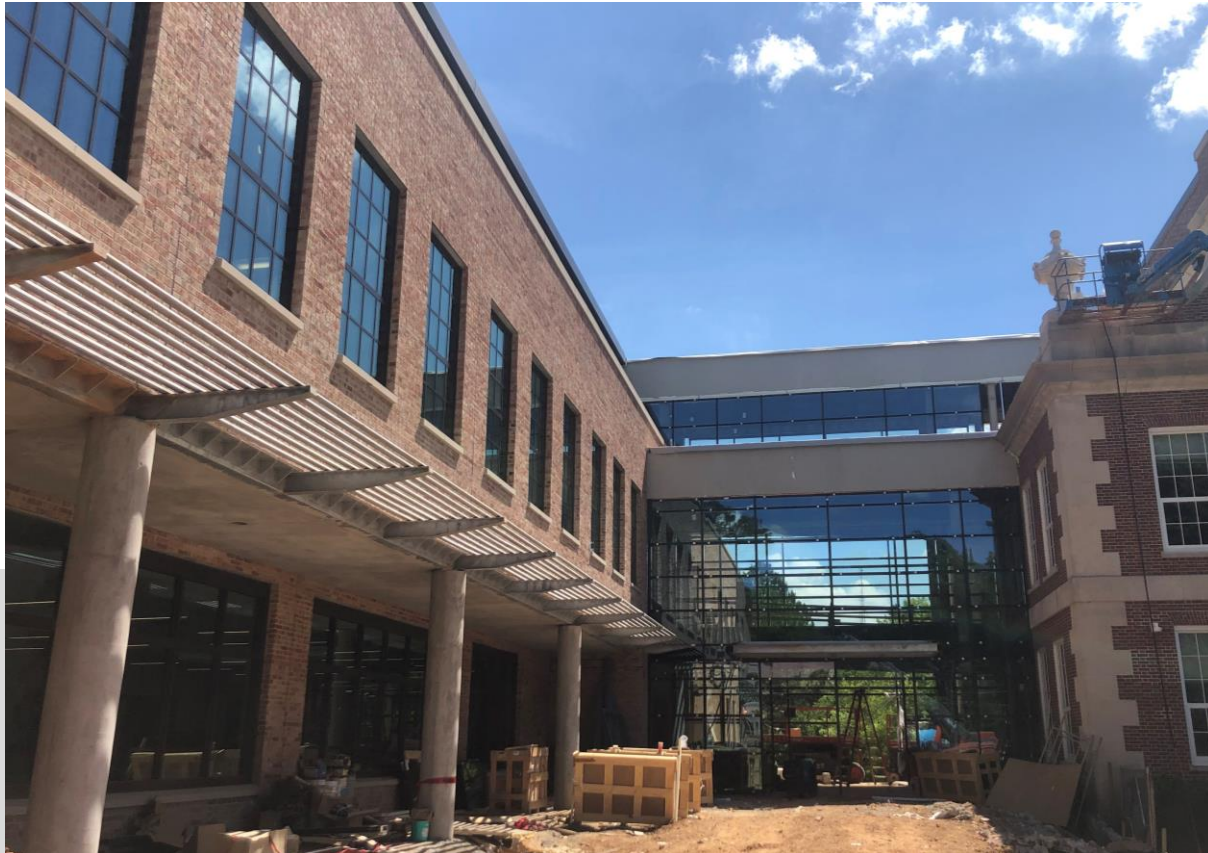
Curtainwall and Bridge Progress at South Elevation