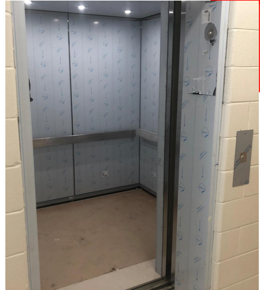
New Addition Building Elevator Completed